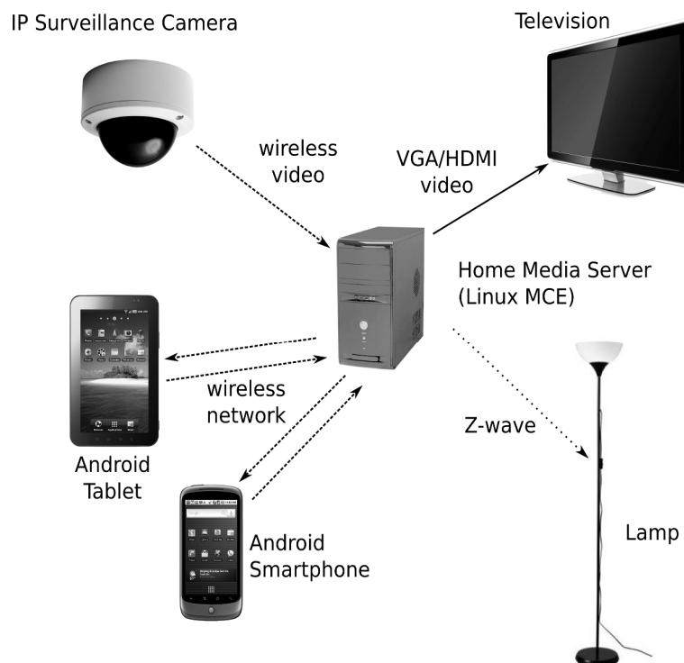
FIGURE 1: Overall system architecture of the Virtual Teratak

The overall system architecture of Virtual Teratak is presented in Figure 1. The objective of this system is to enable the home users to control their home appliances in a more convenient and intuitive manner using smartphones or tablets. A home media server known as LinuxMCE is used in the system to provide the services of controlling and monitoring various home appliances connected through a wireless setting. Various movies are stored in the home media server itself, which is directly connected to a TV on the initial prototype. Other home appliances (lamps, fans, etc.) are each connected to a Z-wave receiver and communicate over radio frequency at the 908MHz band with a Z-wave transmitter that is connected to the home media server. Devices that support Internet Protocol (IP), e.g. the IP surveillance camera, would be accessed directly through the home network (refer to Figure 2). Customized home control applications were developed to allow users to control home appliances on Android phones and standard PCs.