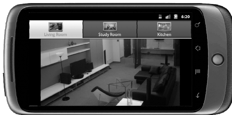
FIGURE 3: Augmented Photo Interface of the Virtual Teratak