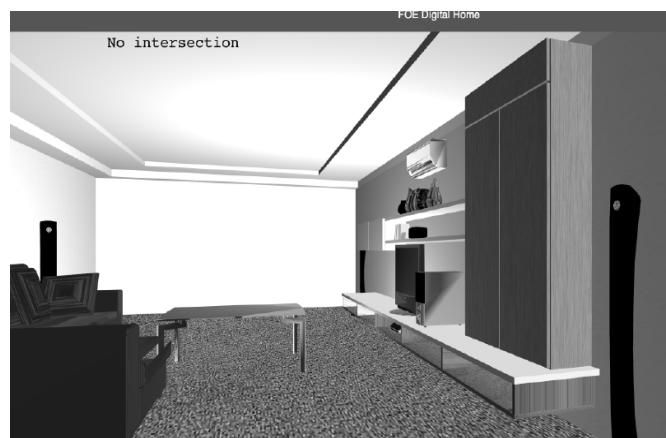
FIGURE 4: 3D Virtual Home of the Virtual Teratak