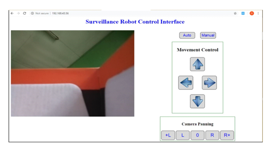
FIGURE 3: Surveillance Robot Web Interface.