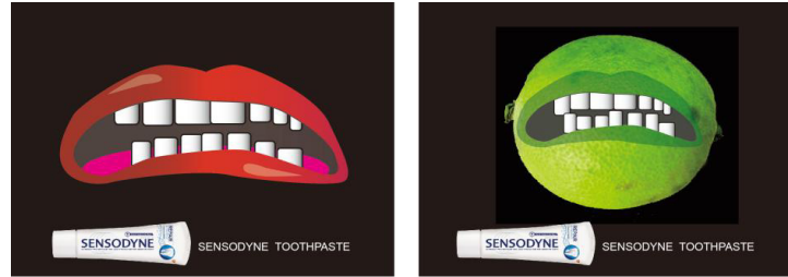
High brand awareness/direct advertising technique High brand awareness/metaphorical advertising technique.