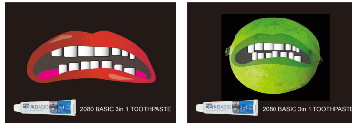
Low brand awareness/direct advertising technique Low brand awareness/metaphorical advertising technique.