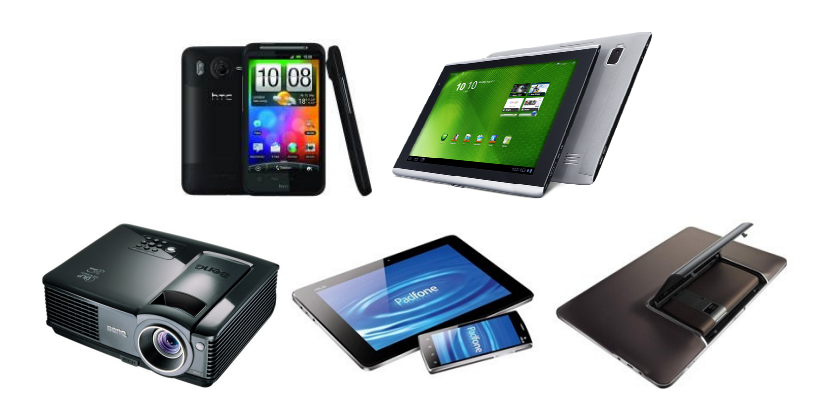
FIGURE 1: Famous electronics products of Taiwan.