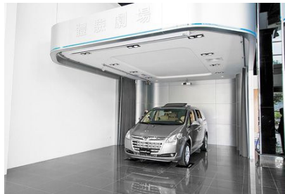
FIGURE 4: LUXGEN Exhibition Hall.

In the experience theater, consumers could interact with the virtual reality screen in an independent and undisturbed space, experiencing six major functions of THINK + , Eagle View + 360° and Night Vision + .