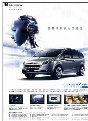
FIGURE 1: LUXGEN7 MPV Magazine Ad.

According to the consumers' favorites in different times, advertising design with differential threshold is easier to attract consumers, generate brand cognition and further form a positive attitude, creating a better advertising effect than the traditional marketing methods.