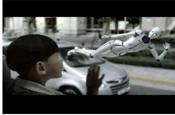
FIGURE 2: LUXGEN7 MPV Television Commercial "Guardian".

High technology humanoid robot was interpenetrated appropriately in the video, the utilization of visual language further convince customers that LUXGEN smart technology can help you to solve such problems.