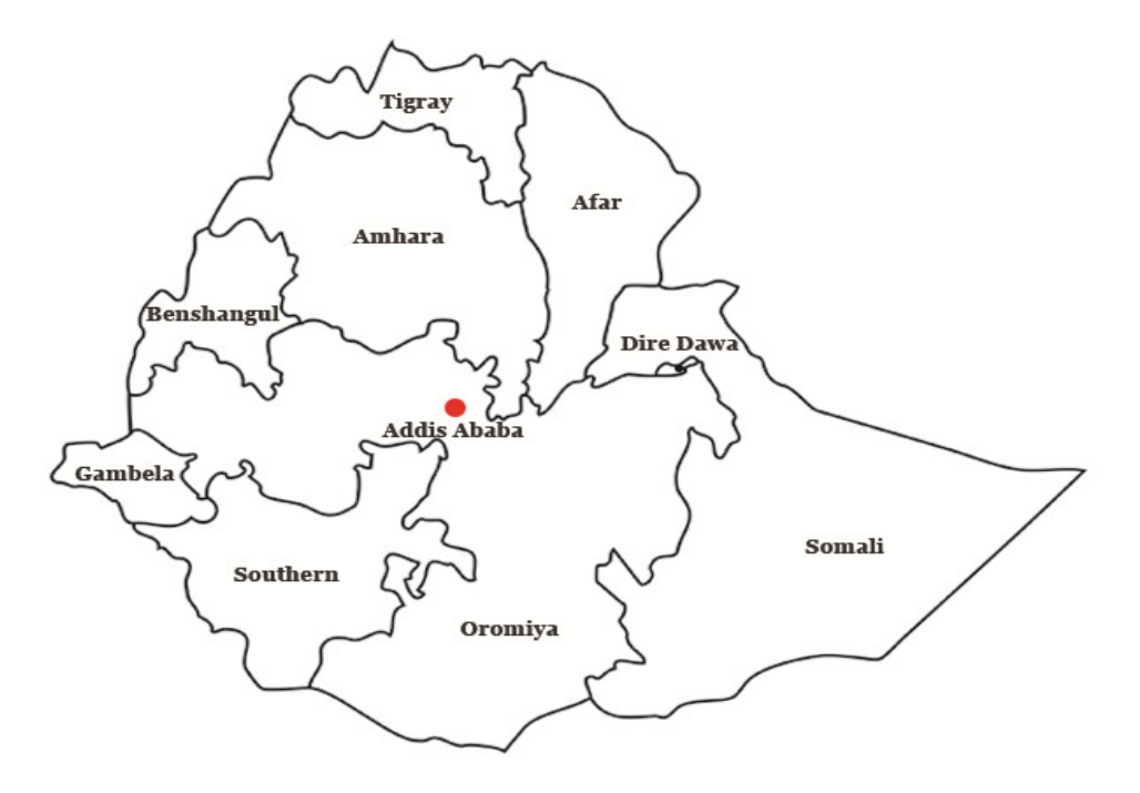
FIGURE 1: An Ethiopian map showing the regional states in the federal state and Oromo dialects are spoken in Oromia (also spelled Oromiya), which is the biggest regional state in the country. The other dialects of Oromo, Wollo and Rayya, are spoken in Amhara and Tigray regional states respectively ( 26 ).

classifications of Oromo dialects is inconsistent but as stated earlier, it is understandable that a subjective classification can yield inconsistent results.