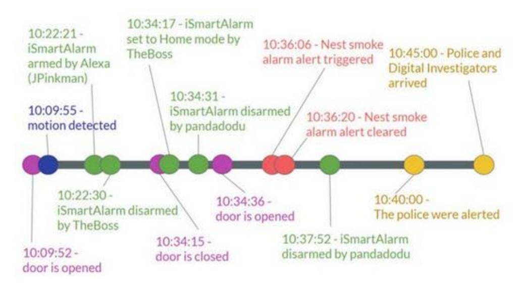
FIGURE 4: A sample timeline analysis of events [24].