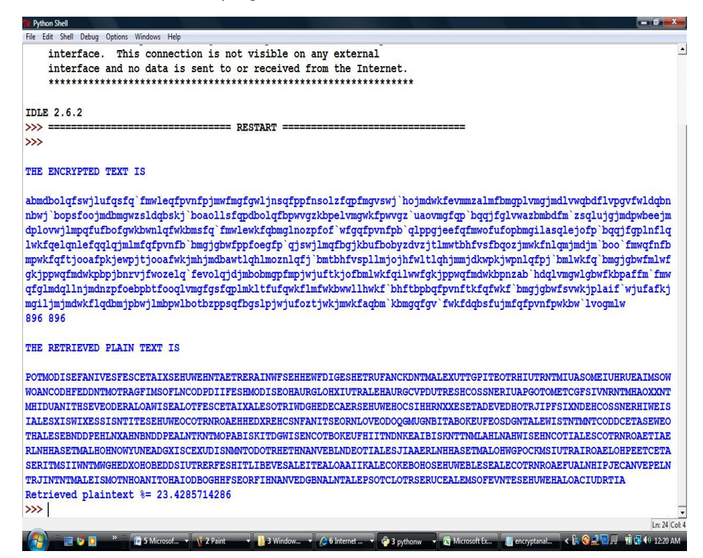
FIGURE4: Retrieved Text based on Frequency distribution in English

From the above table, it is easy to infer that cryptanalysis of text of complex languages like Telugu is much more difficult. On an average the percentage of plain text retrieved in case of English is 39.11 where as in case of Telugu it is only 12.13%. Then the larger key size applicable to Latin text can be reduced in case of complex languages like Telugu even by providing greater level of security. The percentage of plain text retrieved is not linear with text size because a proper threshold function is required to map cipher text symbols to corresponding plain text symbols for which the work is in progress.