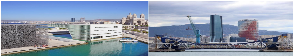
FIGURE 3: Euroméditerranée in Marseille.

This case study is an urban regeneration project of the entire French city to rejuvenate it and give it new impulses after the disposal of the port, an event that recorded a significant decline in earnings and, consequently - an increase in unemployment (Figure3). The French government has recognized how to direct interventions in the city can make Marseille more attractive for national and international investments and try to make it one of the most famous and wealthiest cities in the Mediterranean, thus challenging the dominance of metropolises such as Genoa,