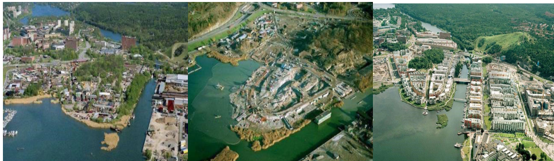
FIGURE 2: Hammarby Sjöstad in Stockholm.

It is a district near the city center which has been chosen as a site undergoing sustainable development; it is located in the southern part of the city and is located along the lake (Sjo) Hammarby and its name means "City waterfront in Hammarby" (Hammarby Waterfront Town) (Figure 2). Industrialization, born initially as an agricultural area, began to be present only towards the end of the nineteenth century, given its strategic position with the city center. During those same years, particularly from 1917 onwards, Hammarby Sjöstad underwent several urban interventions that made it more and more fertile territory for investments, such as the construction of a canal to connect the city to the Baltic Sea or even lines of railways to promote heavy industry (e.g., General Motors, Luma bulbs).