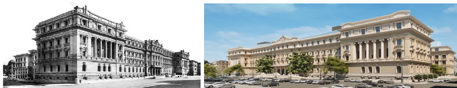
FIGURE 4: Ex Poligrafico in Rome.

Historic building located in the Parioli - Pinciano residential district, precisely in Piazza Verdi, between two large green lungs of the city, Villa Ada to the north and Villa Borghese to the south. This urban regeneration intervention is considered a "particularity" compared to the previous ones in Stockholm and Marseille. In this case, we are talking about a single building that will be wholly reorganized after urban regeneration interventions are promoted - and here is the further peculiarity - by a private company, both Enel S.p.a and Rosewood Hotels and Resort International limited. In this case study, the State intervention does not seem to exist, or in any case, it seems to be marginal to the completion of the work.